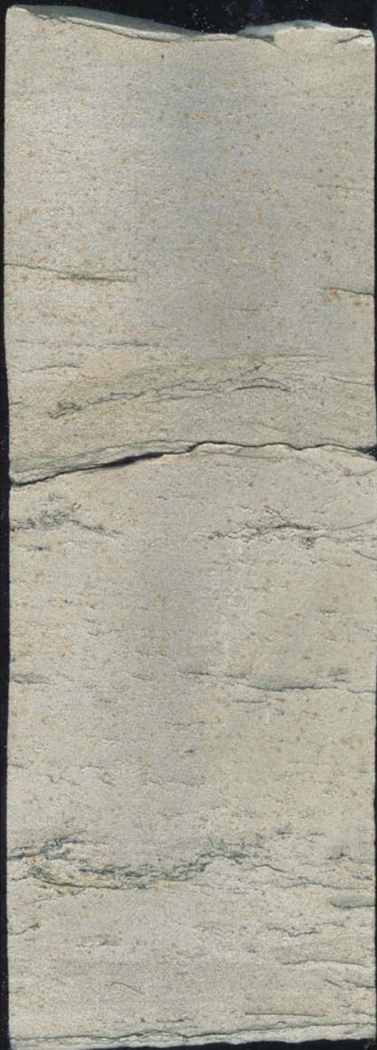
Heterolithic Flaser bedded facies. Hopp1605.10-1616.5