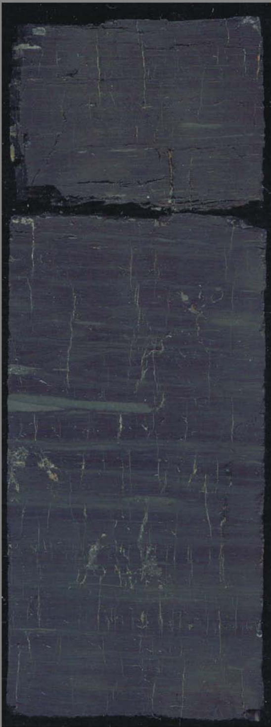
Coal Facies. Sample from 1288.6-1291.2' in Forest City LLC, Hopp #1-16 Image 2.01d