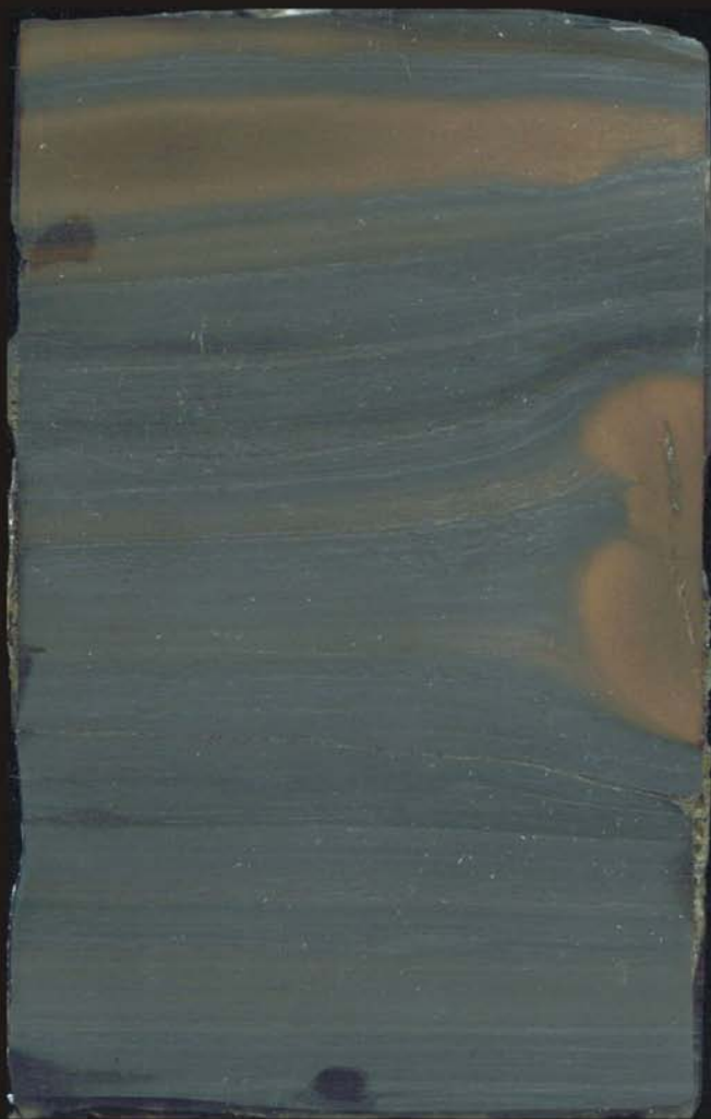
Sideritic dark gray shale, Hopp 1544.5-1544.9