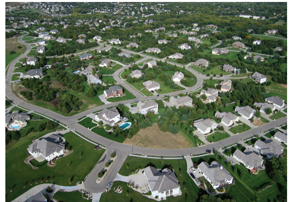
Upper above: Cimarron River in Morton County; Lower above: Manhattan in Riley County; Left upper: Big Brutus, world's second largest electric shovel, in Cherokee County (note the regular-size shovels at the bottom and people on road in upper left for scale); Left lower: Woodson County State Fishing Lake; Below: Glaciated Uplands in Jefferson County.