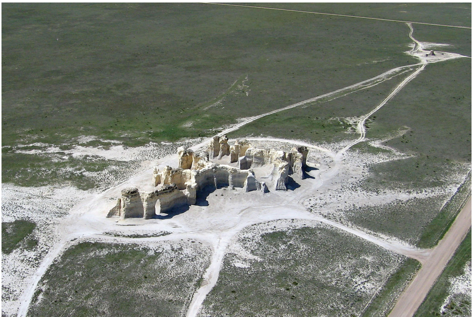
Top: Flint Hills in Chase County; Middle and Lower: Monument Rocks in Gove County from different angles.

“At nearly every site we photograph, we discover something unexpected.” — Jim Aber