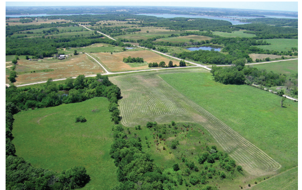
All photographs used with permission of the authors.